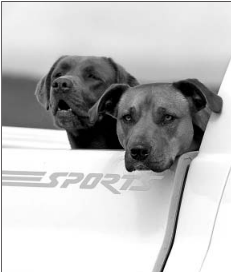
Covered: Blue Dog Insurance has policies for tradies and their dogs.